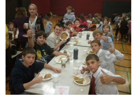
AMERICUS & NLC JUNIOR HIGH