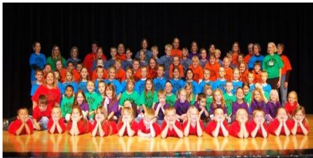
‘Tis the Season

Wednesday’s theme was “Learning Takes You Around the World”. Students dressed like another part of the world. Thursday’s theme was “Education is your Future”. Students dressed as their future profession or dressed to show their future college spirit. Friday’s theme was “Our School is Cool”. Students wore their school shirts. The students had a spelling bee and popsicles at the end of the day.