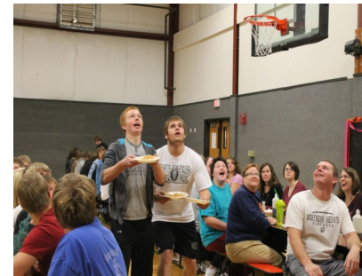
NORTHERN HEIGHTS HIGH SCHOOL